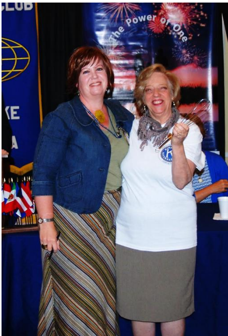
Cannonball Run Team Won for Highest Participation

KPAD Update: We are now at $19,085 as of last week's turn-in ( $3,240 ), way to go! K-Hogs ($4,240) are still doing awesome in first place... the Cannonball Runners ($3,775) are hanging tight in 2nd! Pedal to the Medal is coming in close at $3,590 and Soapbox Derby ($3,045) edged out Triple Crown ($2,755) . The 40-Yard Dashers are still in it with $1,575 . Don't forget! Anyone who sells $100 or more gets a free KPAD t-shirt. The winning team will get a private box at the Salem Red Sox!