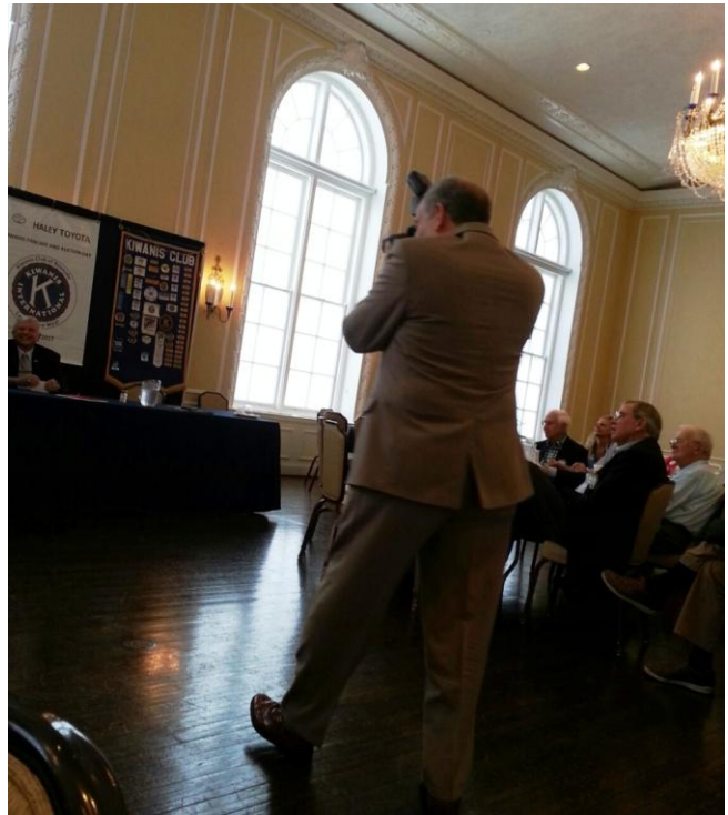
The Man Behind the Camera