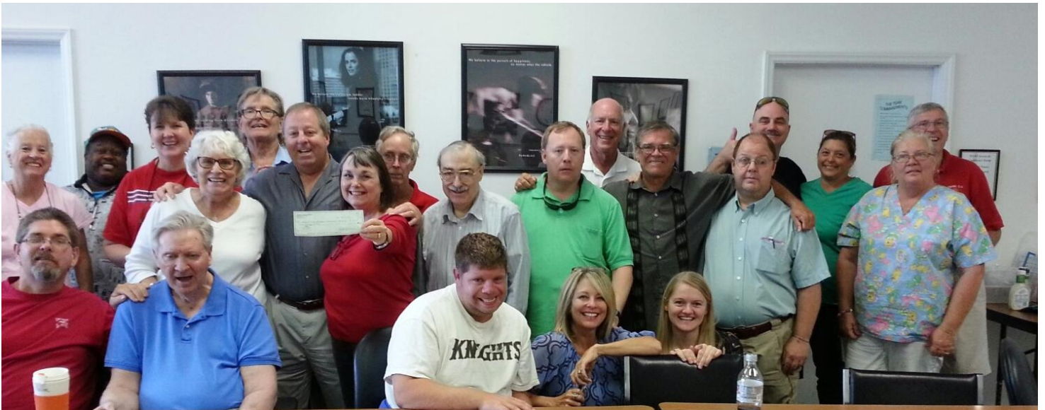
Phoenix Star AKtion Club Receiving their $500 Service Leadership Check from the Club