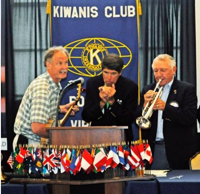
A Rousing Rendition of When the Saints Go Marching In!