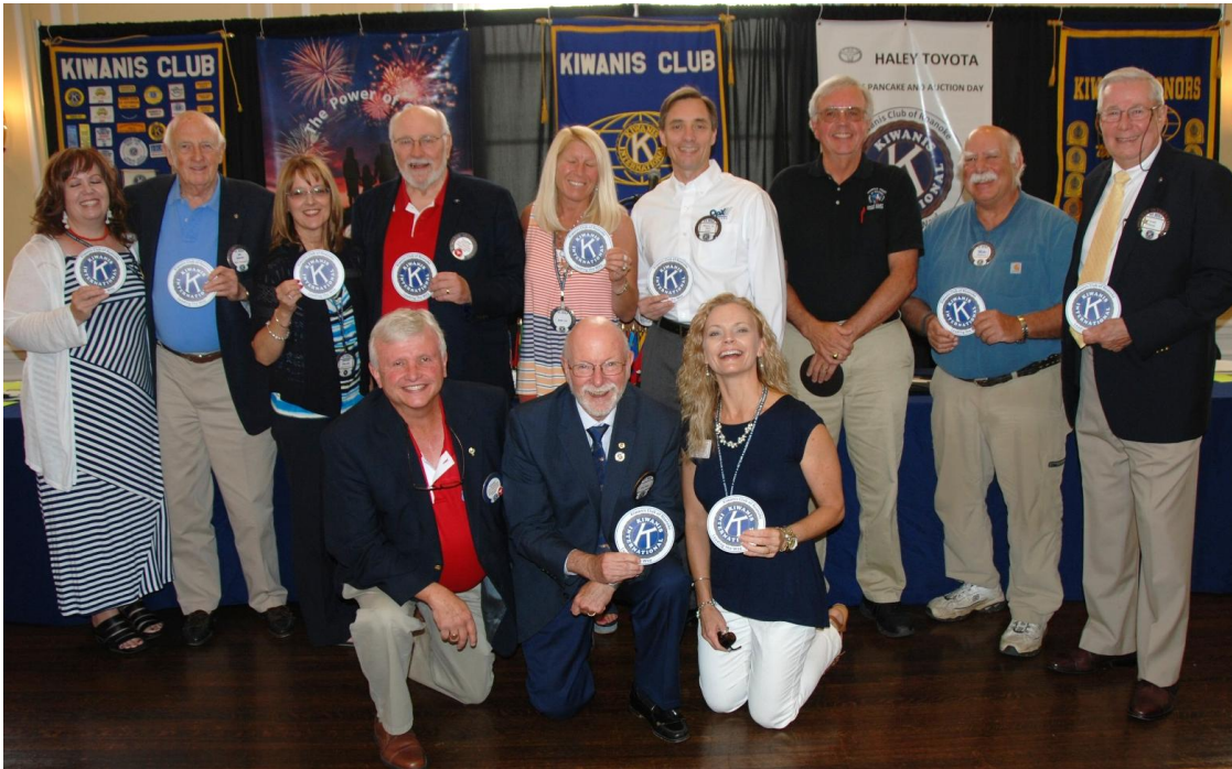
The Strategic Planning Committee - results will be reviewed in August