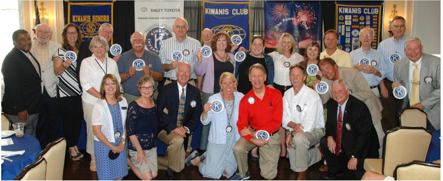
Haley Toyota KPAD Sales Teams & Operations Recognitions - we sold $34,835 in tickets, $801 in door sales, $4,681 in auction sales and $10,000 in sponsorship. What a ride!