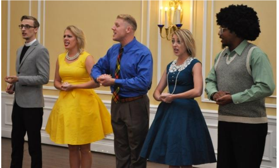
The Cast of Best Christmas Pageant Ever Performed Last Week