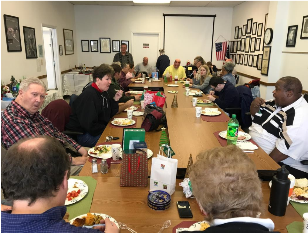
AKtion Club Christmas Luncheon this week