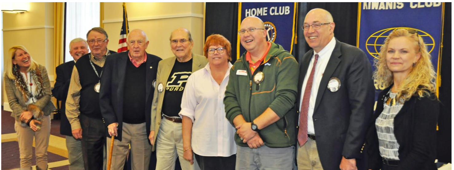
Huge Thanks to the Bocce Tournament Committee!