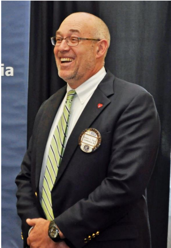
Lionberger Construction was recognized as the Legacy Business of the Year by the Roanoke Chamber