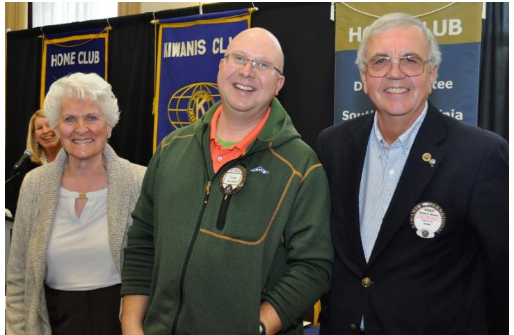
Another Great Program from the First Responders Committee!